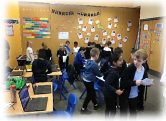
Homes class Observers live in.